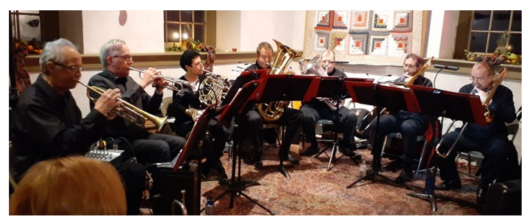
The Mount Laurel Brass in concert.

Kick off your holidays with a festive musical evening in the candlelit Wolf Academy. We are pleased to present the Mount Laurel Brass. This group of talented, accomplished musicians will entertain you with selections that range from beautiful holiday classics to rollicking funny selections.