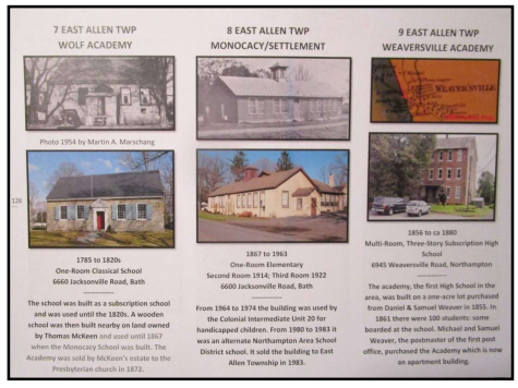
Sample East Allen/Bath page.

An extensive and informative discussion of county schools is followed by a chapter for each municipality. These chapters include an introduction, maps to locate the schools, vintage and current building photographs, and a chart with data about each school. A school name index and 468 source bibliography complete the 291 page book.