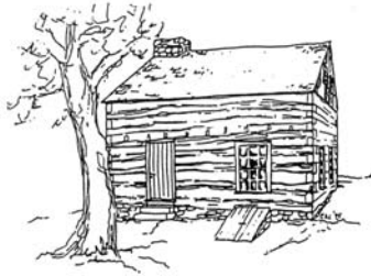
Siegfried Log Cabin

The Governor Wolf Historical Society is a non-profit organization dedicated to the preservation of local history through education as well as the preservation and restoration of historically significant structures.