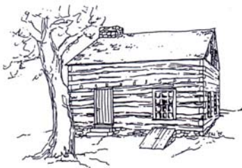
Siegfried Log Cabin

We are so pleased with our new acquisitions and cannot wait to see them all in their new home. The next time you are visiting the GWHS, please stop and take notice of these wonderful pieces.