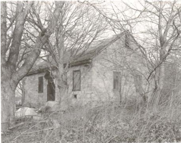
This is the front and south side of the Wolf Academy.