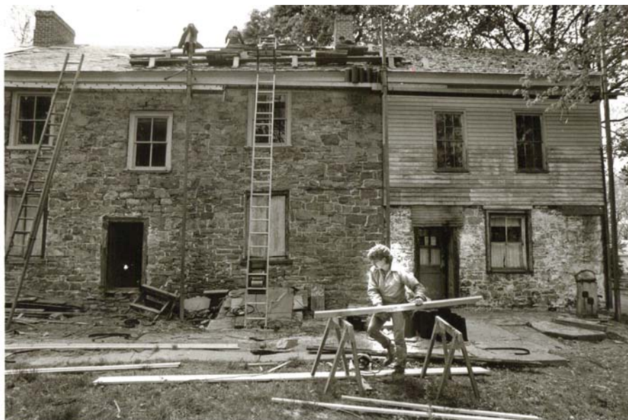
This is the rear of the Ralston McKeen House when the roof was being installed.