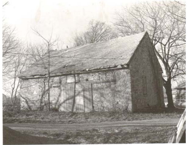
This is the back of the Wolf Academy when it was used as a barn.