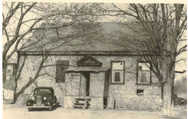
This front view of the Wolf Academy shows it was used as a residence at one point.