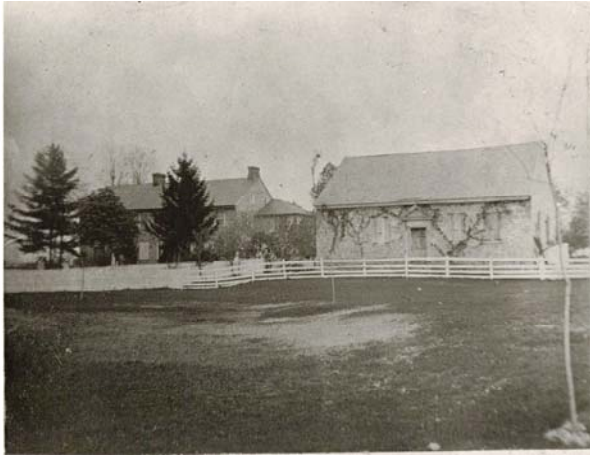
Ralston McKeen House on left, Wolf Academy on right as viewed from the west side. Note the frame addition on the south end of the RMH which was removed.