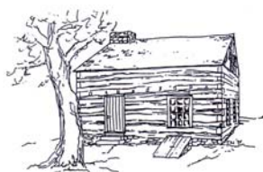
Siegfried Log Cabin

NON-PROFIT ORG. U.S. POSTAGE P A I D LEHIGH VALLEY, PA PERMIT NO. 670