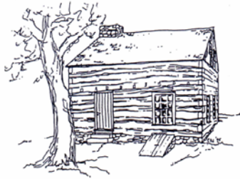
Siegfried Log Cabin

The Governor Wolf Historical Society is a non-profit organization dedicated to the preservation of local history through education as well as the preservation and restoration of historically significant structures.